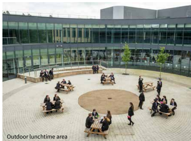
Outdoor lunchtime area