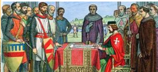
King John and the Barons