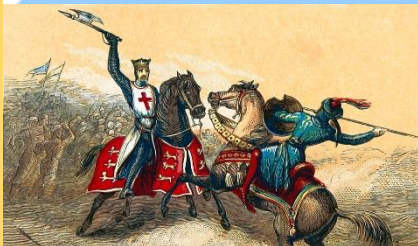
Richard I and Saladin