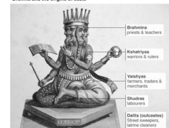
Brahma and the origins of caste

What is the Hindu caste system? Is the caste system an example of prejudice and discrimination? Why is the caste system unacceptable in the 21st Century?